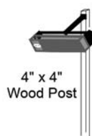
4" x 4" Wood Post