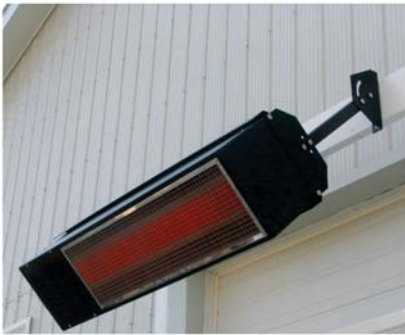
Wall or Ceiling Mount

ABOVE: 17" BEHIND: 8" END: 24" BELOW: 48"