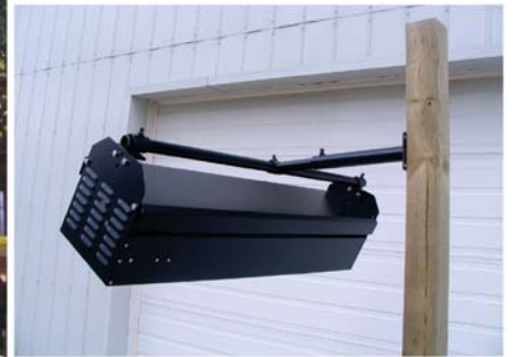
4x4 Post Mount