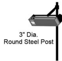
3" Dia. Round Steel Post